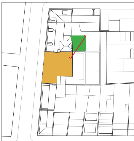
Key plan. 6 Wilkes Street garden is shaded in green and the proposed roof extension in orange. The sectional cut for diagram B is shown in red.

Diagram B shows a second cross section cut through the garden to 6 Wilkes Street and the proposed 4 Wilkes Street roof extension, at the point where it might be expected that the proposals would have most impact on the garden. This diagram illustrates that neither the proposed roof extension nor the terrace screening will be visible from the garden of 6 Wilkes Street and will therefore have no impact on daylight or sunlight reaching the garden.