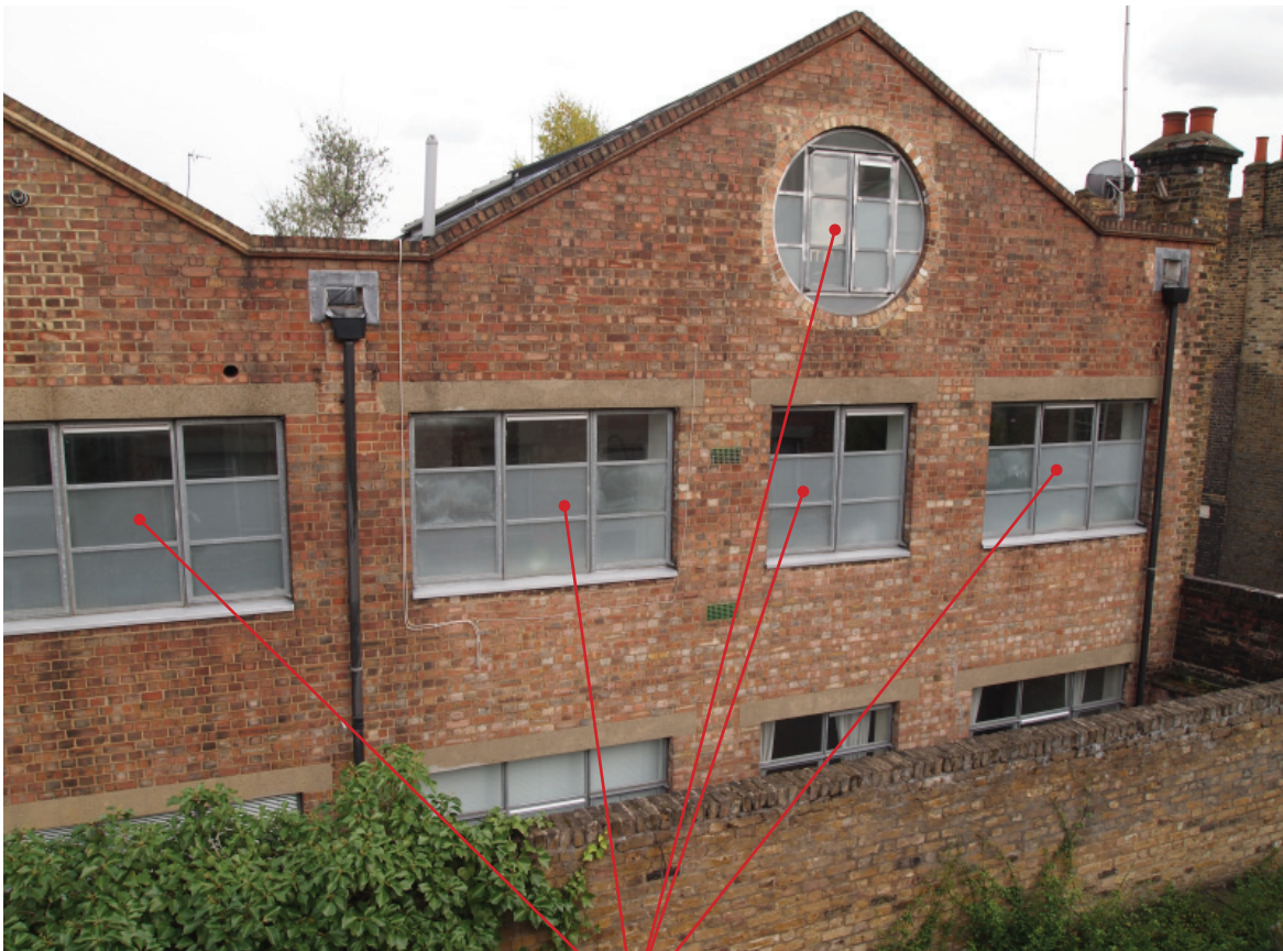
Obscure glazing facing towards the application site prevents views to and from 4 Wilkes Street