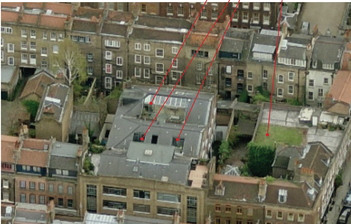
Figure 3: 6-10 Princelet Street viewed from the north