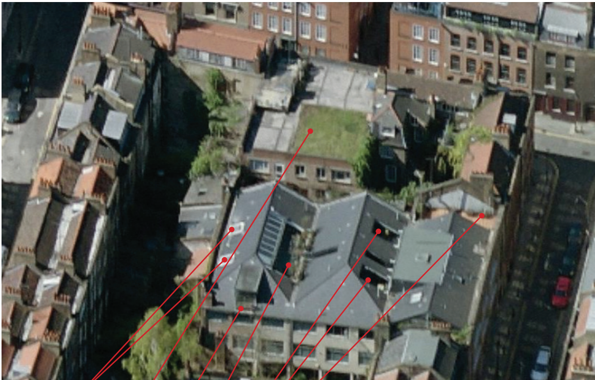
Figure 2: 6-10 Princelet Street viewed from the east